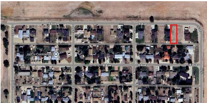
Town of Bassano Vacant Property Listing Details

BEAUTIFUL BASSANO - Welcome to an incredible opportunity to build your dream home in vibrant Bassano for only $5,000! This prime lot has all town services conveniently run to the property line, ready for your vision. Enjoy Bassano's charming community with an outdoor pool, local arena, parks, and a revitalized downtown. Buyers must submit a development permit application within 6 months of signing for a taxable improvement per LUB 921/21. There is also a build timeline requirement and minimum build size of 1400sqft with a front attached garage. Allowed property types include Prefab Homes and Stick Build. Mobile homes are NOT allowed. Call now to get more information as we have multiple lots available!