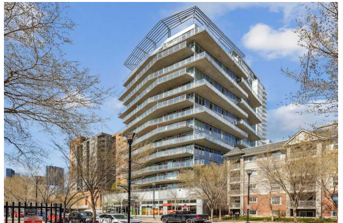
506 624 8 Ave SE - 04/17/2025 Main - 648.16 sq.ft/ 60.21 m2 RMS Area - 648.16 sq.ft/ 60.21 m2