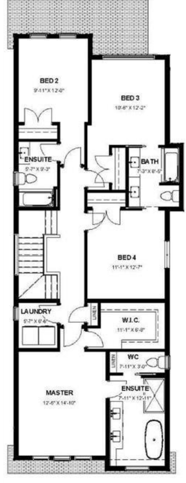
SECOND 1,245 SQ.FT. (4 BEDROOM OPTION)

Listing Office Real Estate Professionals Inc.