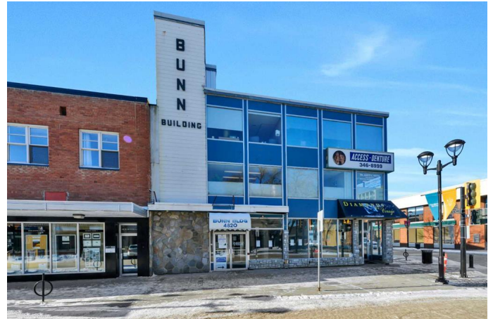
2nd Floor-4820 50 Ave, Red Deer, AB

Come view this office space in the Bunn Building! Great exposure along Little Gaetz with access to many popular shops and restaurants, and plenty of action in the summertime with markets happening every week. This space is 1,612 sq ft and is located on the 2nd floor, but has elevator access. The space has 8 separate rooms that could be used as offices, one is large enough for a boardroom with a sink and cabinetry for storage. There is plenty of natural light streaming in through large windows. Building offers common washrooms and 1 elevator. Monthly rents are all inclusive with no other expenses and there are no long term commitment required.